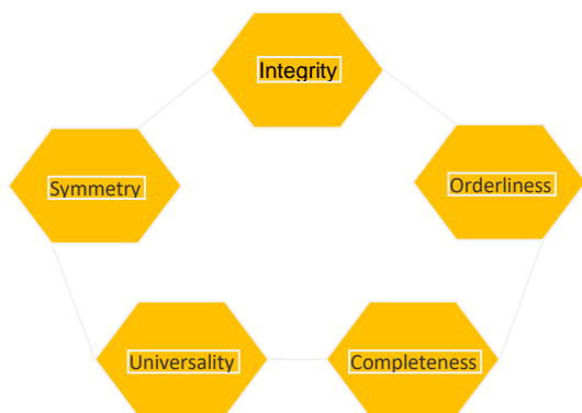
Figure 1 IEM components

Integrity is also interpreted as solidity. The solidity of the IEM system guarantees the reliability of the system data. Reliability in the mathematical sense means that either (D) all the data contained in the IEM datacontainer is reliable, or they are unreliable (D) all together. Intermediate states are impossible. This principle is formally reflected in expression (1). 6